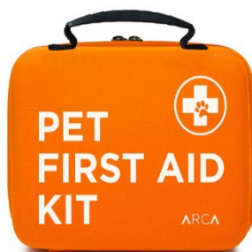
Pet First Aid Kit